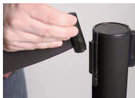
1. Insert the tape into the fastener and lock it in place.