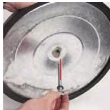
3. Rotate the base sideways and insert the screw (D) into the appropriate hole.