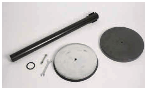
1. Kit includes: base (A), base top (B), post (C), screw (D), wrench (E), gasket (F).