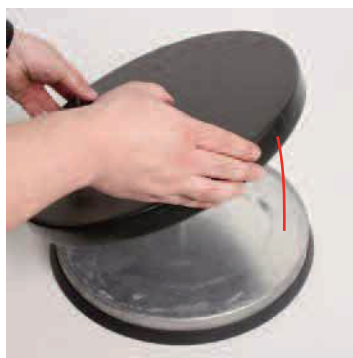
2. Place the base(A) on the floor and place the top(B) on top of the base.