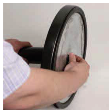
6. Place the post and base on their side and initially secure the screws with your fingers.