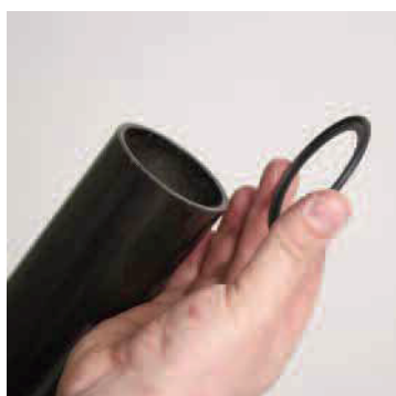
4. Insert the gasket (F) onto the column part (C).