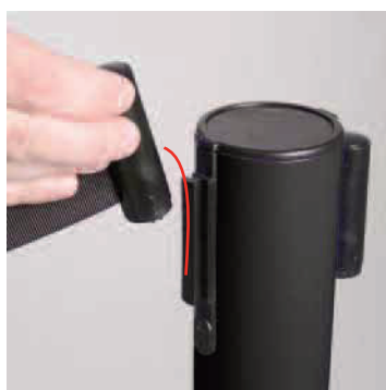
8. Stretch the tape from the first column to the second by inserting the end of the tape on the appropriate hook.