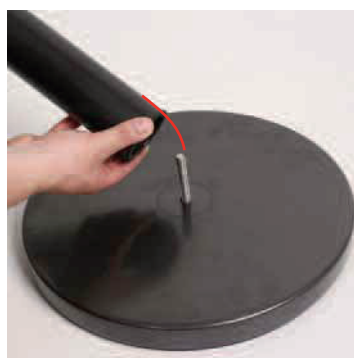
5. Place the pedestal and gasket on the screw above the base.