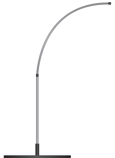
Assembled flag structure