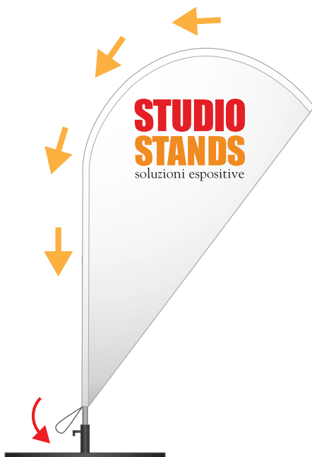
3. Insert the structure into the slot of the print and secure by applying the strap to the base hook.