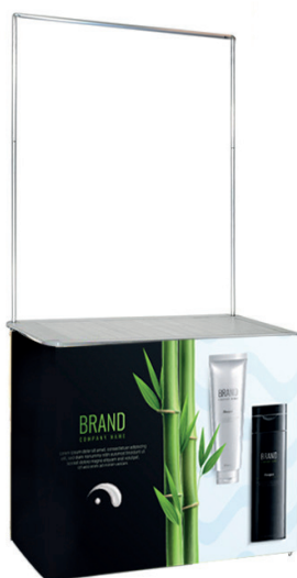
4. Leg Print Only