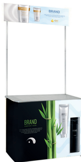
3. Structure + Double-sided Crown Print + Leg Print