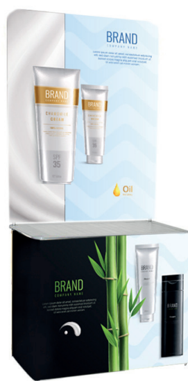
6. Structure + Entire backrest print + Leg print