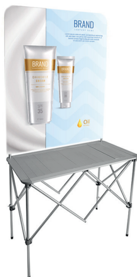
5. Structure + entire backrest print