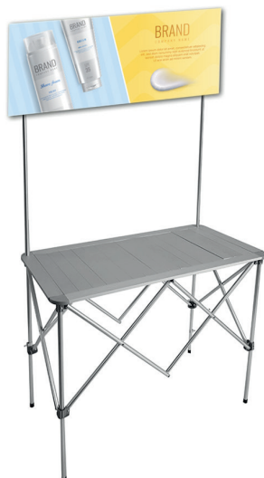
2. Structure + Double-Sided Crown Print